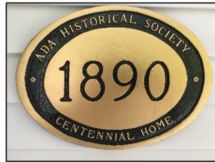
Sample Exterior Plaque