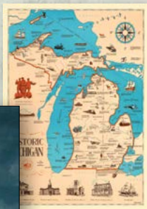
Historic Michigan Map